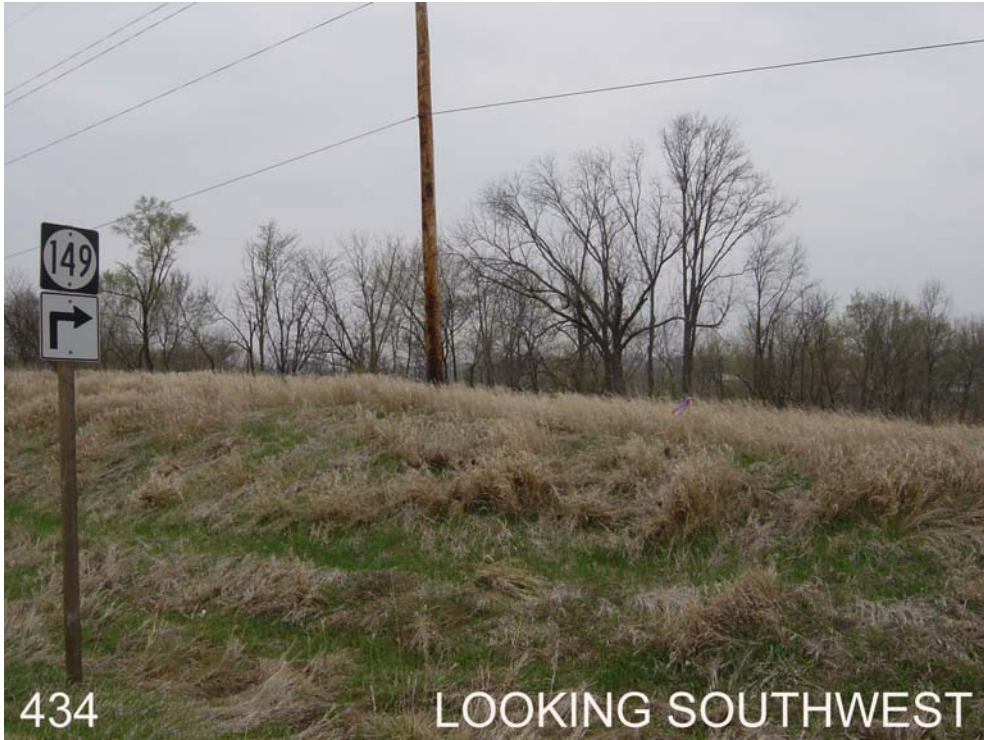
#434 is 55ft west of the west edge of Hwy 149, 55ft south of field ent to the west, approx. 600ft north of Hwy 92. Approx. 600ft north of the SE corner of Sec 36, T76N, R12W.