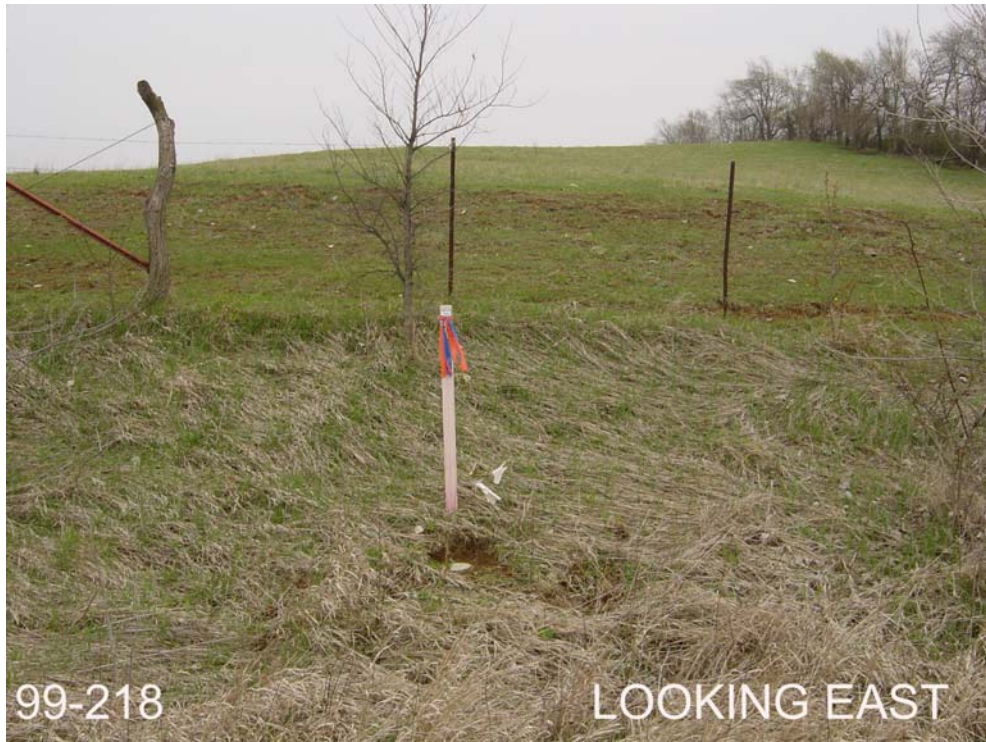
Found Iowa County GPS point 99-218 on 4-17-03