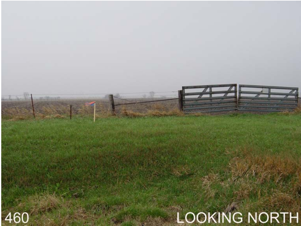
#460 is 5ft south of the north ROW fence, 25ft west of a field ent to the north, 60ft north of Hwy 92, 0.2mi east of 310 th Ave. In the SW ¼ of Sec 34, T76N, R10W.