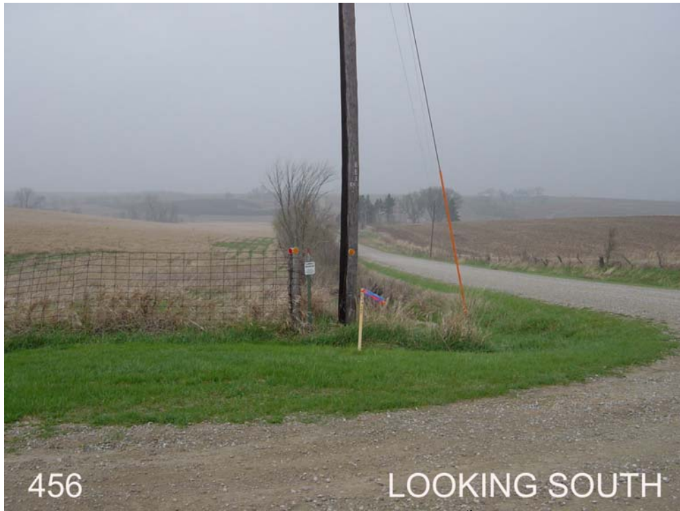
#456 is 5ft north of power pole, 30ft east of 305 th Ave, 25ft south of Keokuk/Iowa Rd. In the NE ¼ of Sec 4, T77N, R10W.