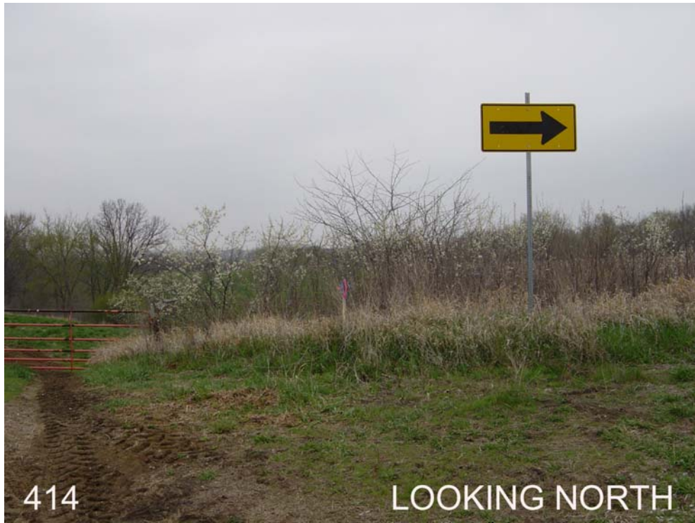
#414 is 45ft northwest of 90 degree curve in 270 th St, 12ft east of field ent to the north. ¼ mi north of the S ¼ of Sec 33, T75N, R13W.