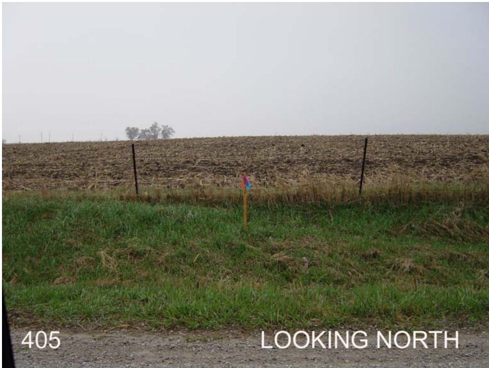
#405 is 4ft south of the north ROW fence, 30ft north of 250 th St, 0.1mi east of Zephyr Ave. 0.1mi east of the SW cor of Sec 18, T75N, R13W.