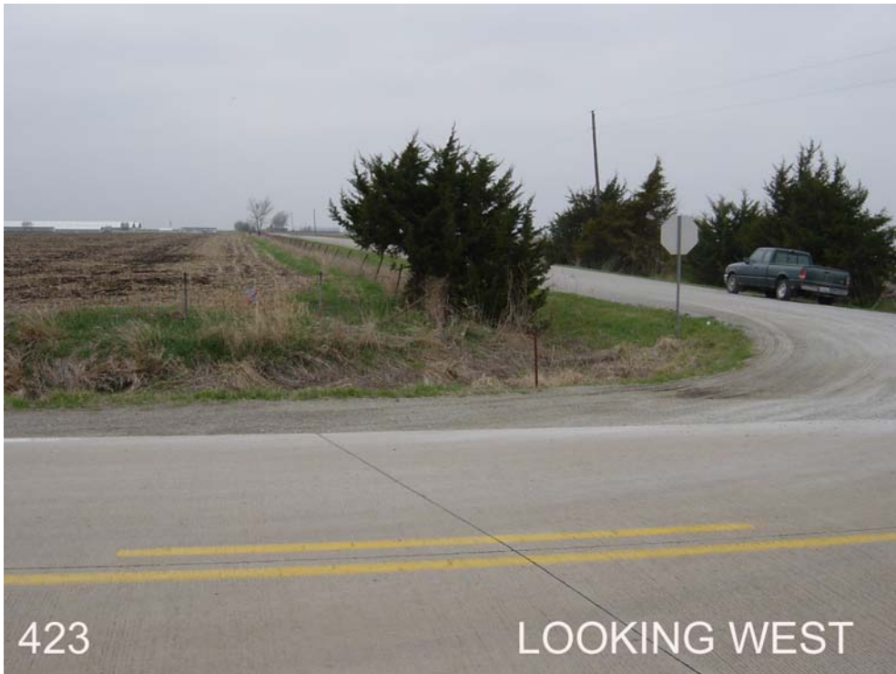
#423 is 3ft east of the west ROW fence, 50ft south of 103 rd St, 50ft west of 190 th St. In the NE ¼ of Sec 4, T77N, R12W.