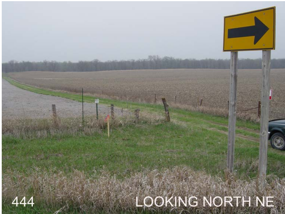
#444 is 5ft south of north ROW fence, 20ft west of field ent to the north, 45ft NE of curve(255 th St to west, 240 th Ave to south). Near the E ¼ corner of Sec 20, T75N, R11W.