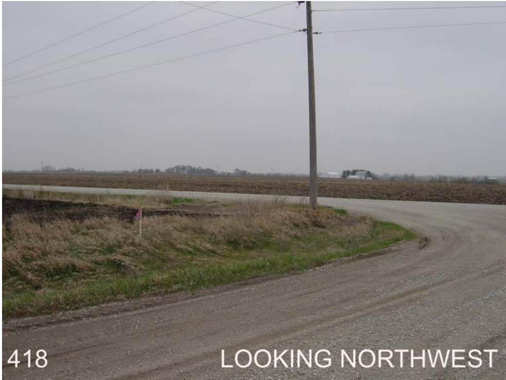
#418 is 30ft west of 163 rd Ave, 60ft south of 195 th St. In the SW ¼ of Sec 19, T76N, R12W.