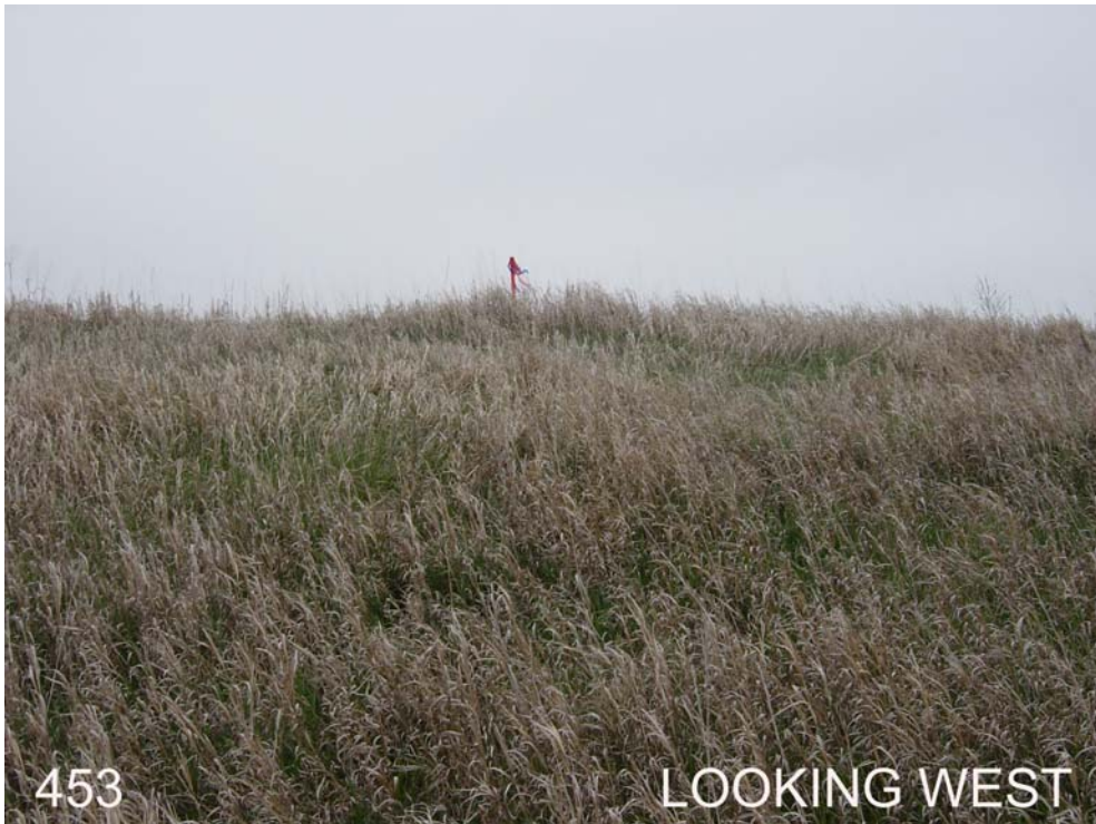
#453 is approx. 200ft west of V67 on top of high bank of back slope, 0.1mi north of 280 th St. In the SE ¼ of Sec 36, T75N, R11W.