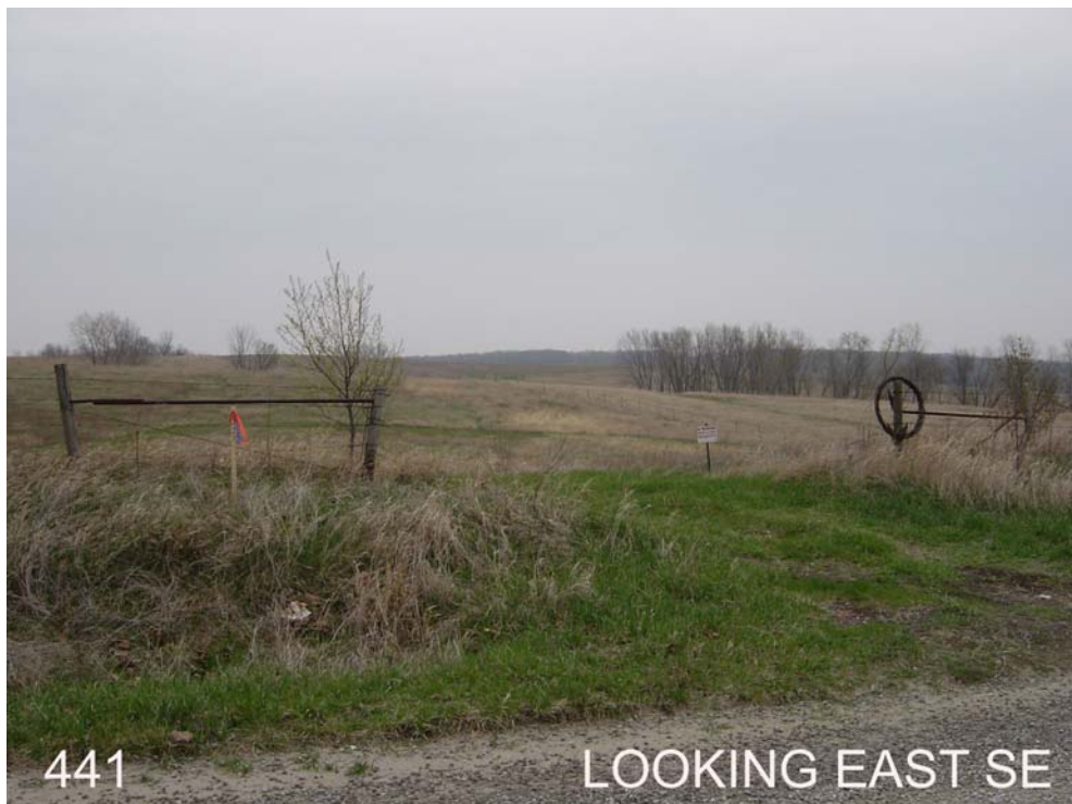
#441 is 30ft east of 250 th Ave, 18ft north of cl of field ent to the east. Near the SW corner of Sec 15, T76N, R11W.