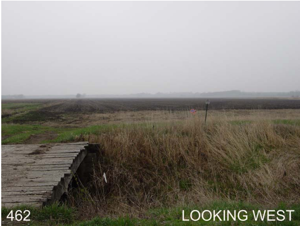
#462 is 20ft north of wood plank bridge over ditch, on an extension of 268 th St to the west, 33ft west of 305 th Ave. Near the S ¼ corner of Sec 28, T75N, R10W.