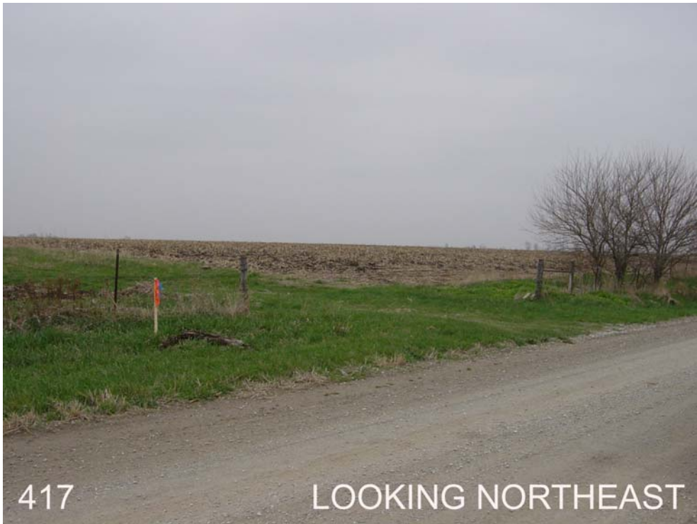
#417 is 3ft south of the north ROW fence, 25ft west of field ent to the north, 25ft N of 160 th St, 170ft east of 160 th Ave. Near the SW corner of Sec 31, T77N, R12W.