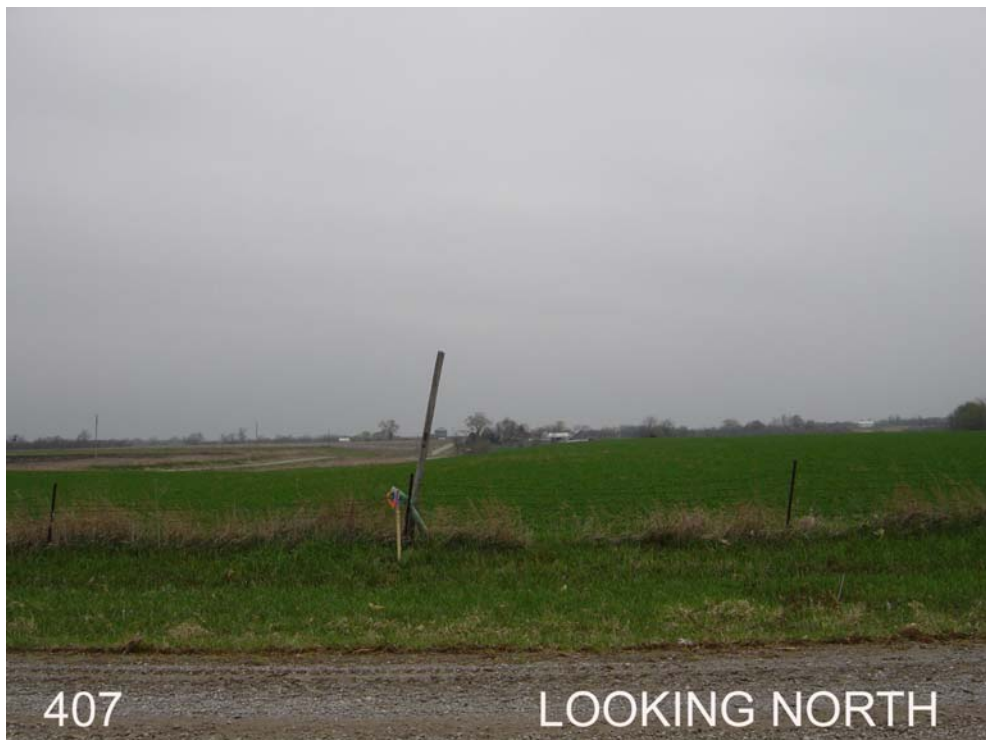
#407 is 3ft south of the north ROW fence, 30ft N of G65, approx. 200ft east of Yates Ave. Near the W1/4 corner of Sec. 18, T74N, R13W.