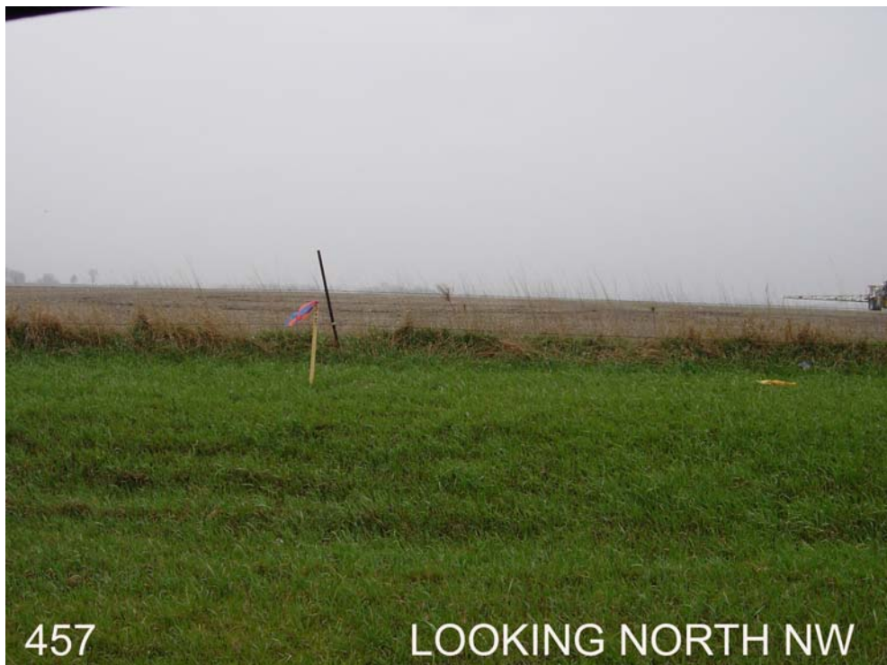
#457 is 5ft south of north ROW fence, 40ft north of north edge of Hwy 22, approx. 300ft west of 312 th Ave. In the SW ¼ of Sec 22, T77N, R10W.