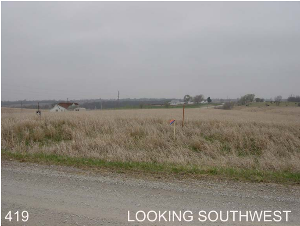
#419 is 5ft east of ROW marker, 30ft west of 163 rd Ave, 30ft north of field ent to the north, 0.1mi north of Hwy 92 In the SW ¼ of Sec 31, T76N, R12W.