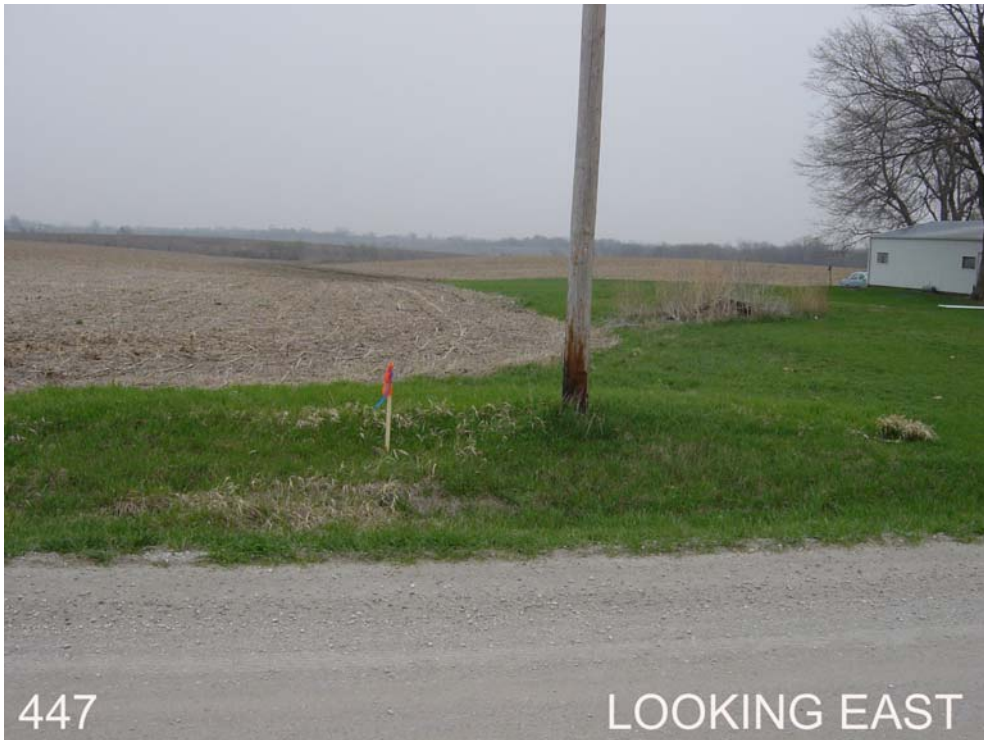
#447 is 6ft south of power pole, 30ft east of 250 th Ave, 0.2mi north of county line. In the SW ¼ of Sec 34, T74N, R11W.