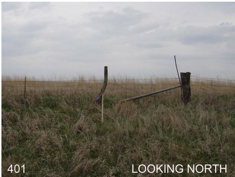
#401 is 5ft south of north row fence, 10ft west of offset in row fence, 30ft north of cl 130 th St, Approx. 0.3mi east of the west line of Sec 18. In the SW ¼ of Sec 18 T77N, R13W.