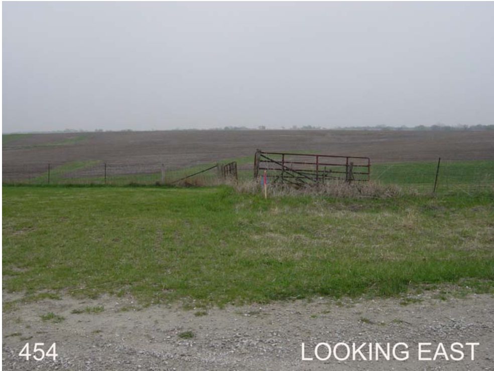
#454 is 4ft west of east ROW fence, 25ft south of entrance to “Church of the Brethern Cemetery”, 50ft east of 280 th Ave, approx. 500ft south of section line. In the NW ¼ of Sec 19, T74N, R10W.