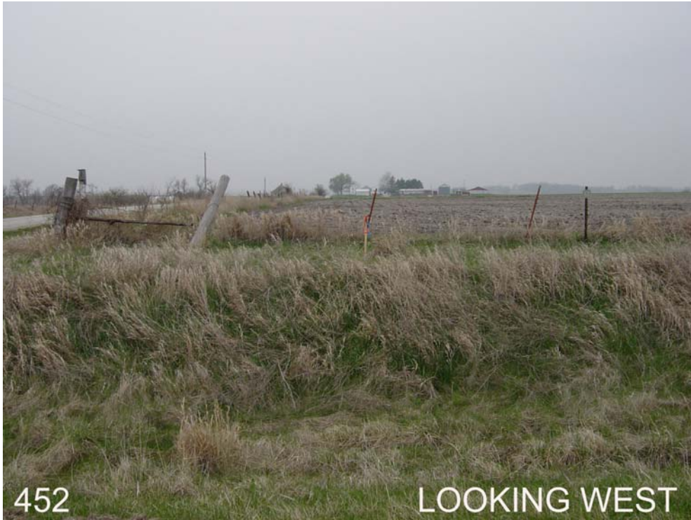
#452 is 5ft east of the west ROW fence, 50ft west of the east edge of V67, 60ft north of 250 th St. Near the SE corner of Sec 13, T75N, R11W.