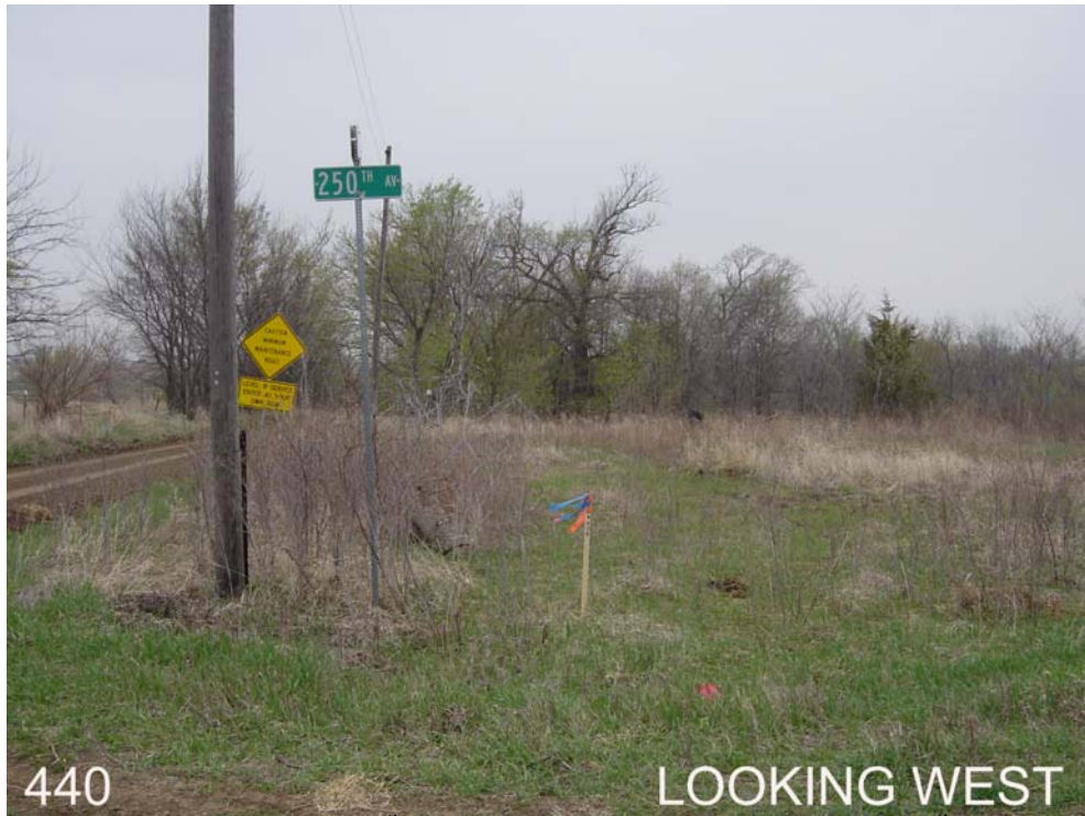
#440 is 25ft north of 160 th St, 50ft southwest of curve in 250 th Ave. Near the SE corner of Sec 33, T77N, R11W.