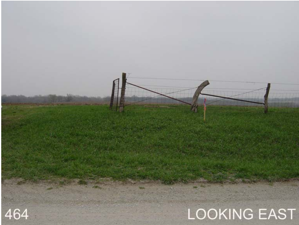
#464 is 5ft west of east ROW fence, 30ft south of field ent to the east, 30ft east of 310 th Ave, 150ft south of 310 th St. In the NW ¼ of Sec 22, T74N, R10W.