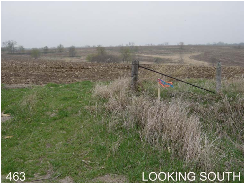
#463 is 3ft north of south ROW fence, 15ft west of field ent to the south, 30ft south of 290 th St, 0.2mi east of 310 th Ave. In the NW ¼ of Sec 10, T74N, R10W.