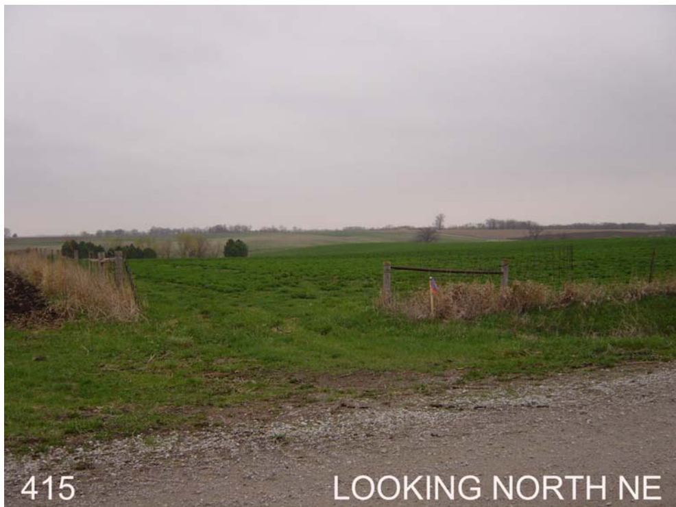
#415 is 3ft south of the north ROW fence, on east edge of field ent to the north, 30ft north of 310 th St, ¼ mi west of 130 th Ave. ¼ mile west of the SE corner of Sec 16, T77N, R13W.