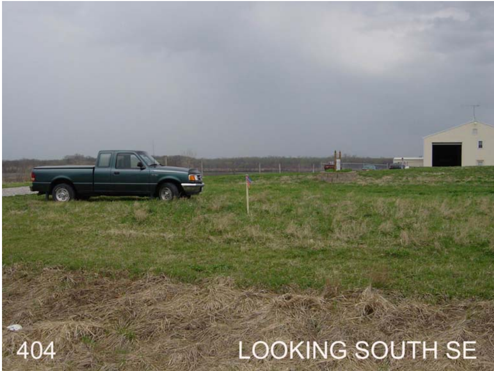
#404 is 30ft west of ent to “Collision Repair Center”, 50ft south of Hwy. 92, approx. 200ft east of Zephyr Ave to north. Near the NW corner of Sec. 6, T75N, R13W.