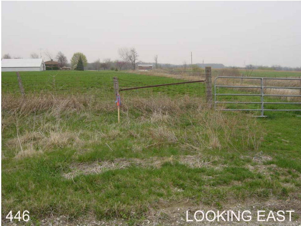
#446 is 3ft west of east ROW fence, 15ft north of field ent to the east, 30ft east of 248 th Ave, 60ft north of 305 th St In the NE ¼ of Sec 16, T74N, R11W.