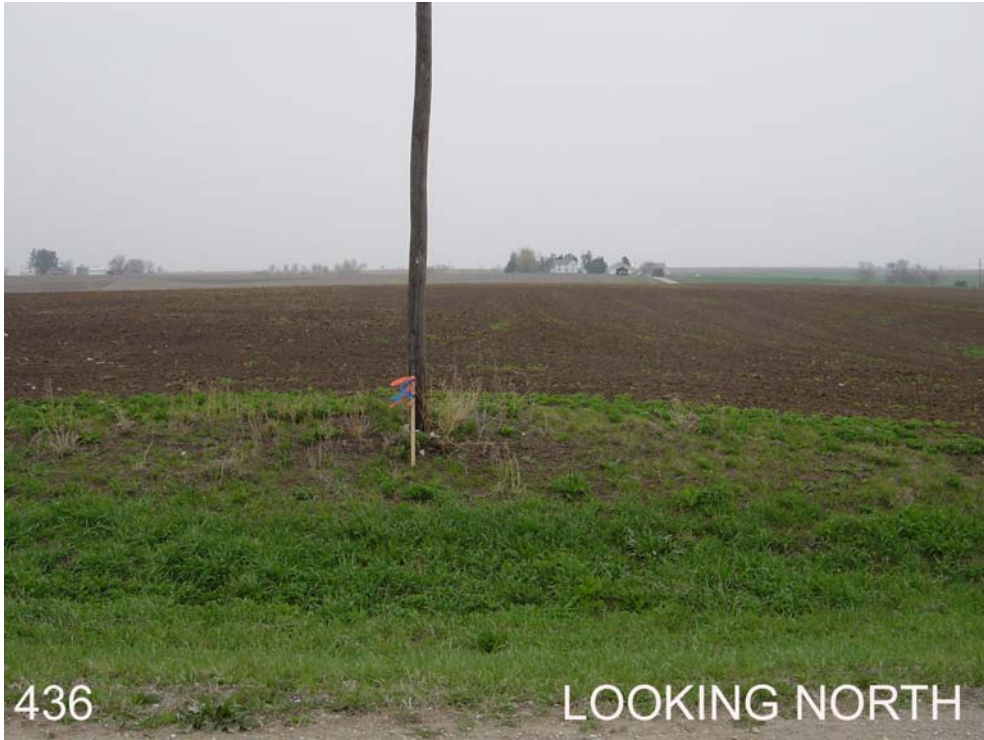
#436 is 3ft south of power pole, 45ft east of field ent to the north, 30ft north of 275 th St, 0.1mi west of 220 th Ave. In the NE ¼ of Sec 36, T75N, R12W.