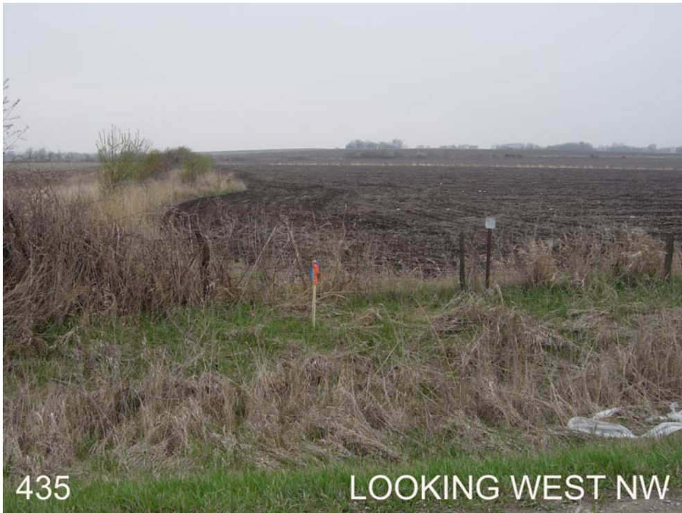
#435 is 3ft east of west ROW fence, 15ft north of the section line, 30ft west of 220 th Ave. Near the SE corner of Sec 13, T75N, R12W.