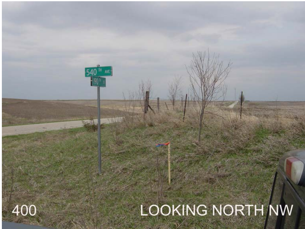
#400 is 30ft north of 540 th Ave, 50ft east of 190 th St(190 th St to the north-Poweshiek Co) Near the NW corner of Sec 6 T77N, R13W.