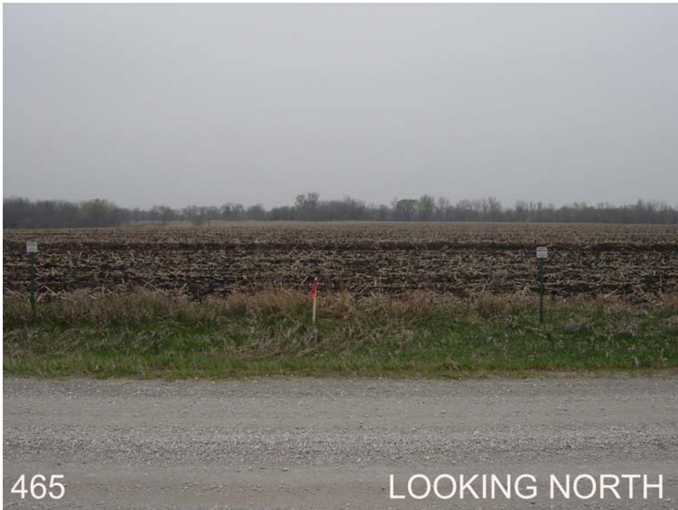
#465 is 30ft north of 335 th St, near the E ¼ cor of Sec 33. Near the E ¼ corner of Sec 33, T74N, R10W.