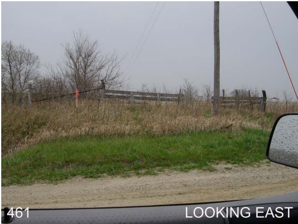
#461 is 5ft west of east ROW fence, 10ft north of field ent to the east, 30ft east of 310 th Ave, 55ft north of 253 rd St to the east. In the NW ¼ of Sec 22, T75N, R10W.