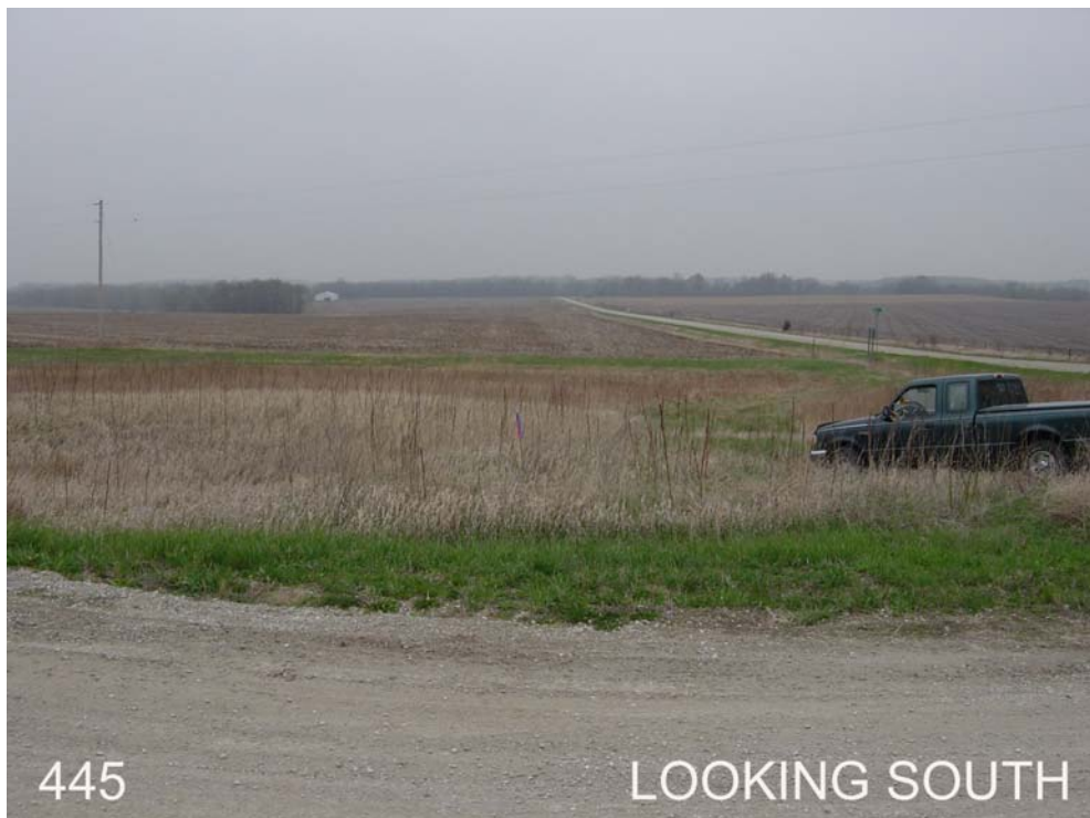
#445 is 45ft southwest of curve in V5G, 50ft south of 253 rd Ave. In the NW ¼ of Sec 3, T74N, R11W