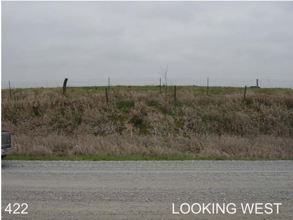
#422 is 25ft west of 160 Ave, 0.1mi south of the NE corner of Sec 24. 0.1mi south of the NE corner of Sec 24, T74N, R13W.