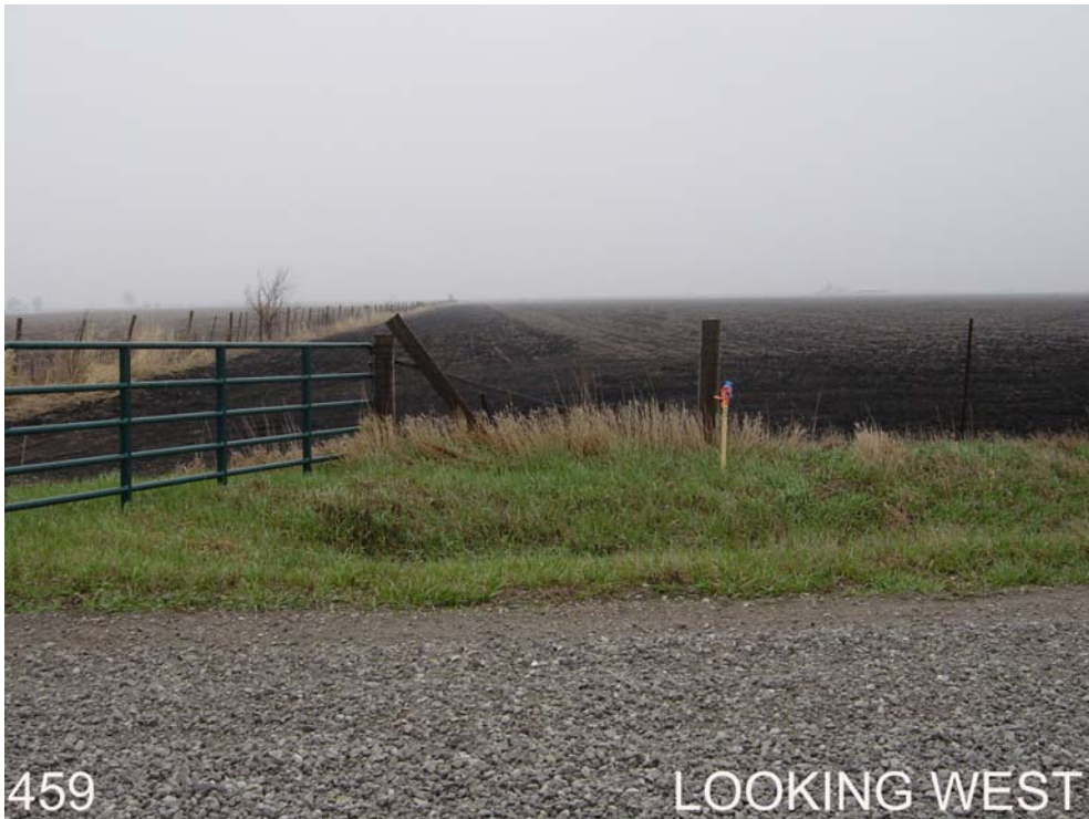
#459 is 3ft east of the west ROW fence, 25ft north of a field ent to the west, 30ft west of 310 th Ave, ¼ mi north of 190 th St. In the SE ¼ of Sec 16, T76N, R10W.