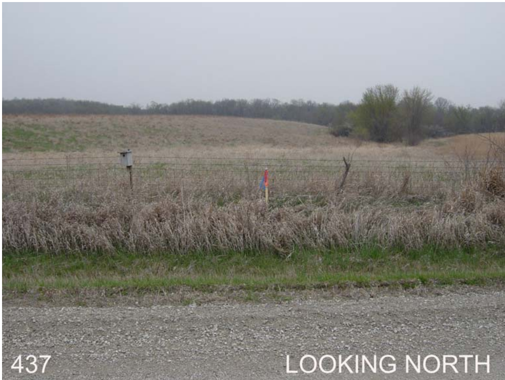
#437 is 3ft south of north ROW fence, 30ft north of 305 th St, 0.1mi east of section corner. In the NW ¼ of Sec 18, T74N, R11W.