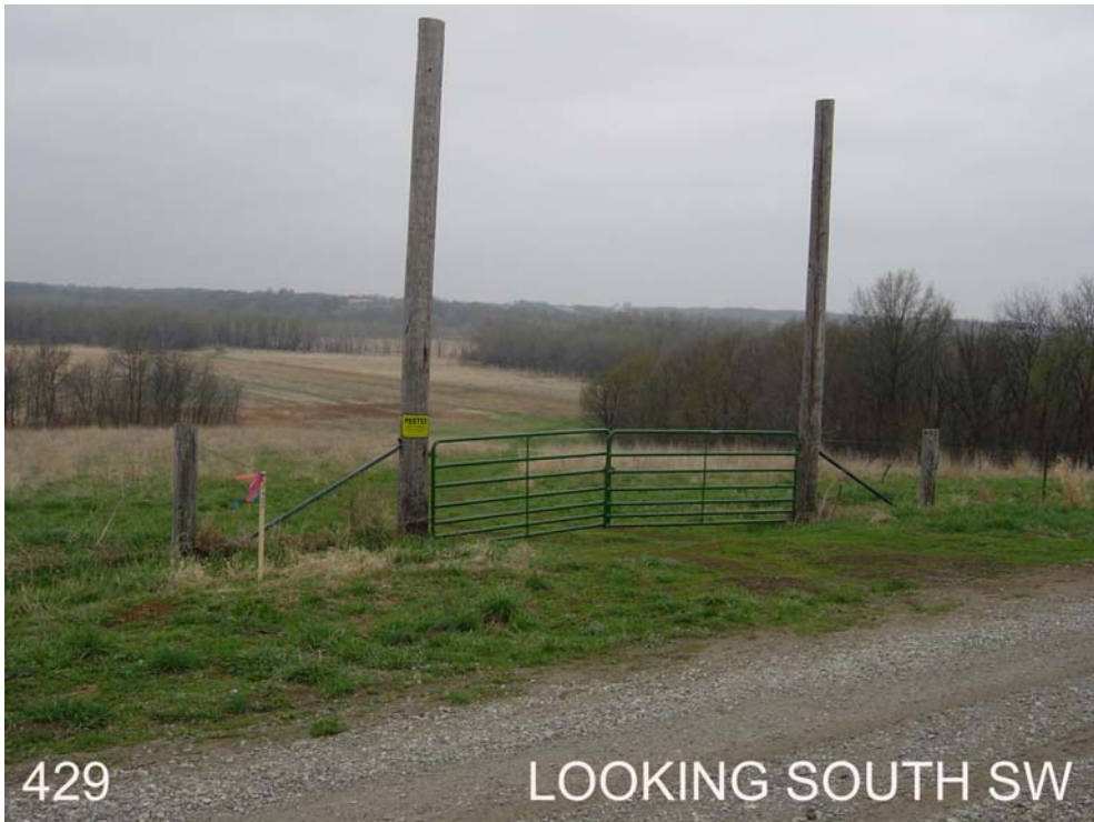
#429 is 6ft north of south ROW fence, 10ft east of field ent to south, 25ft south of 280 th St, 0.1mi east of the NW corner of Sec 3. 0.1mi east of the NW corner of Sec 3, T74N, R12W.