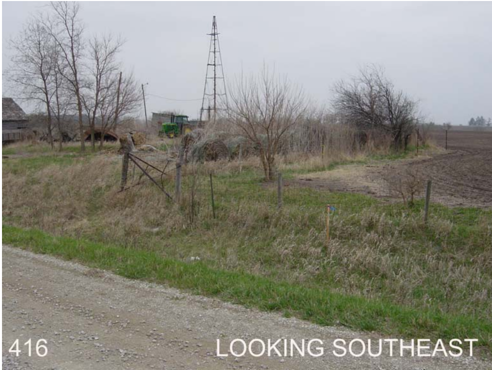
#416 is 4ft north of the south ROW fence, 30ft south of 130 th St, 25ft west of vacated farmstead, ¼ mile west of 160 th Ave. ¼ mile west of the NE corner of Sec 24, T77N, R13W.