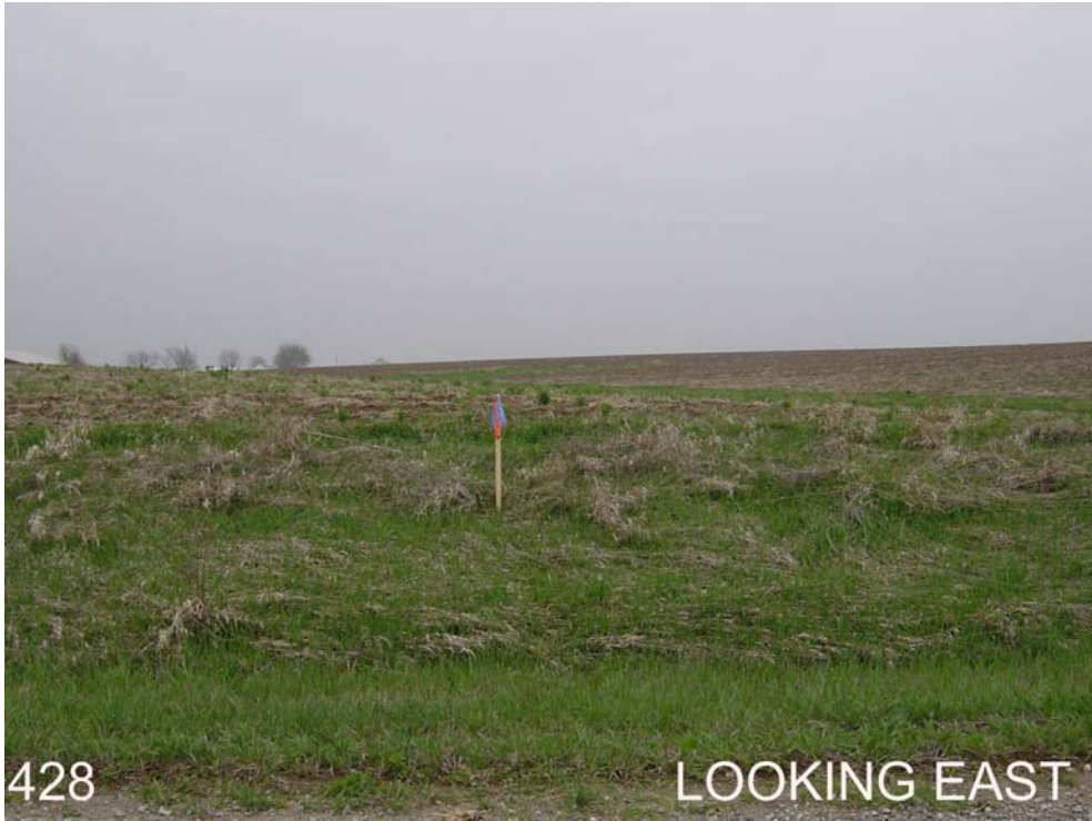
#428 is 25ft east of 190 Ave, approx. 300ft south of 255 th St(to the east) In NW ¼ of Sec 22, T75N, R12W.