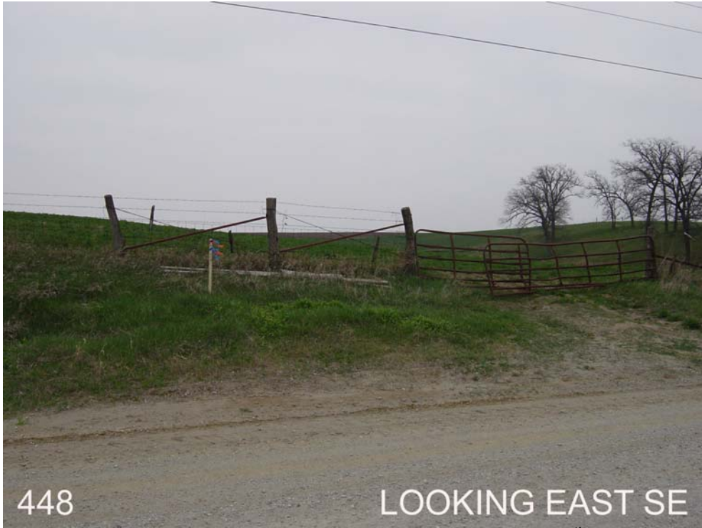
#448 is 25ft north of field ent to the east, 25ft east of 280 th Ave, approx 150ft south of section line. Near the NW corner of Sec19, T77N, R10W.