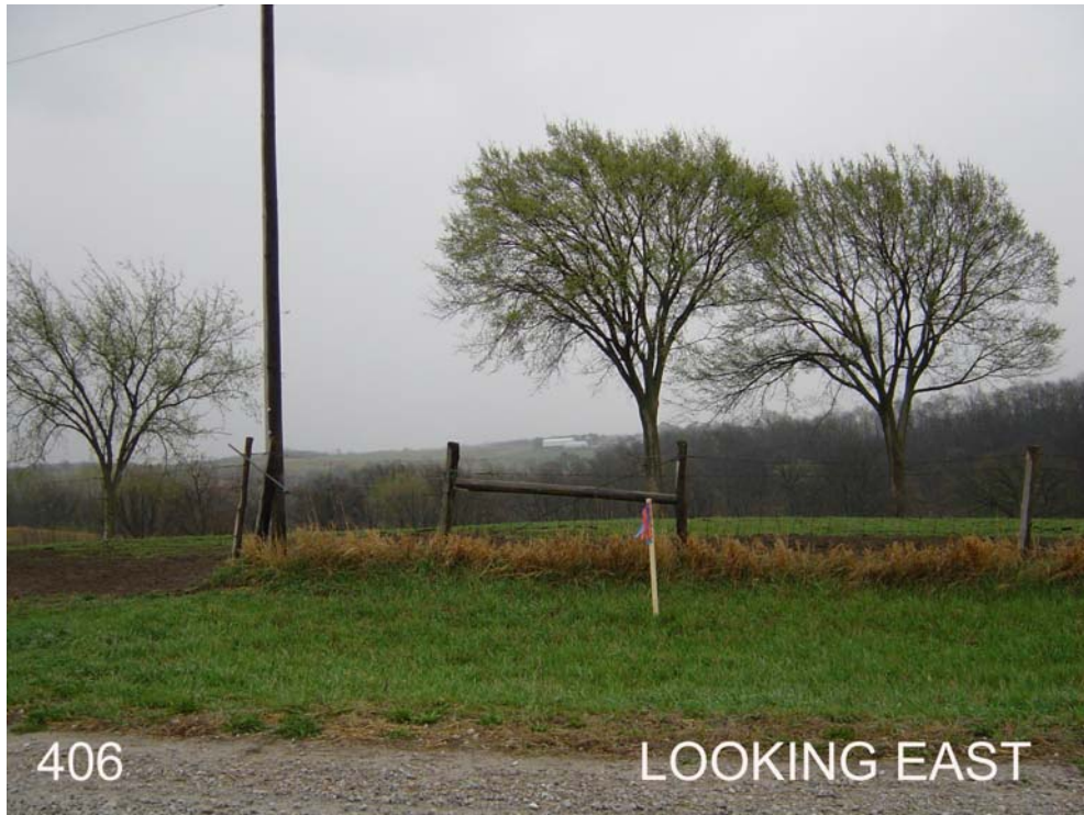
#406 is 5ft west of the east ROW fence, 15ft south of field ent.(to the east), 25ft east of Yates Ave, 0.1 mile south of 280 th St. In the NW ¼ of Sec 6, T74N, R13W.