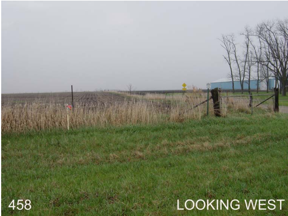
#458 is 4ft east of the west ROW fence, 50ft south of 160 th St, 50ft west of 310 th Ave. Near the NE corner of Sec 4, T76N, R10W.