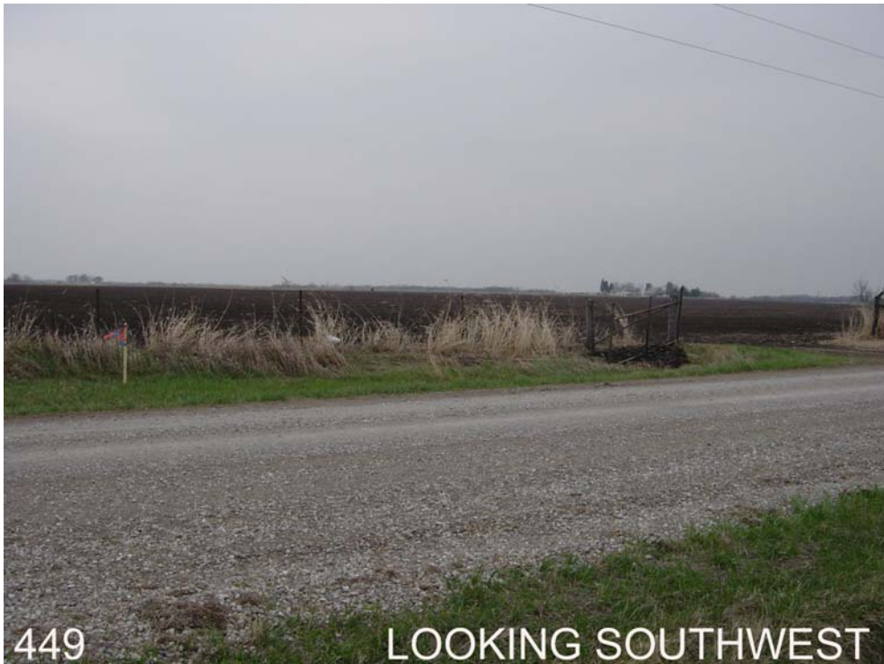
#449 is 25ft south of 160 th St, 60ft east of field ent to the south, ¼ mi east of 280 th Ave. In the NW ¼ of Sec 6, T76N, R10W.