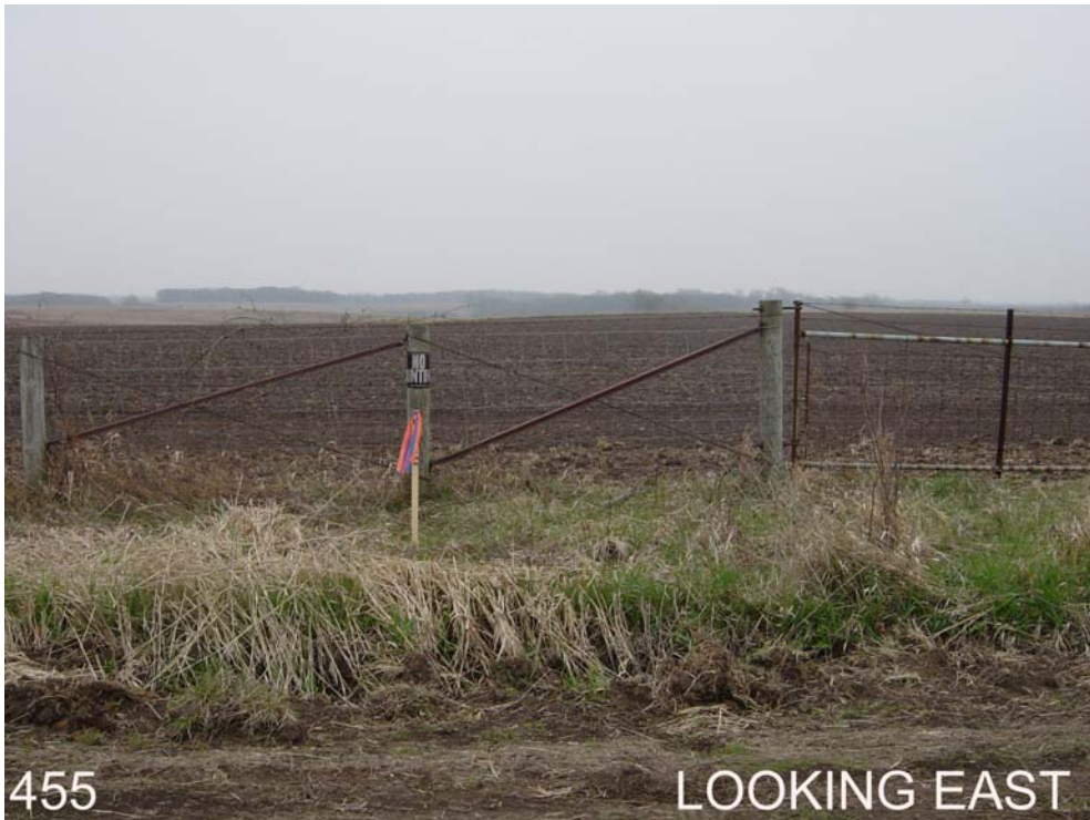
#455 is 4ft west of east ROW fence, 25ft north of field ent to the east, 20ft east of 280 th Ave, 0.1mi south of 335 th St. In the SW ¼ of Sec 31, T74N, R10W.