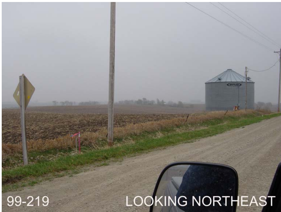
Found Iowa County GPS point 99-219 on 4-18-03